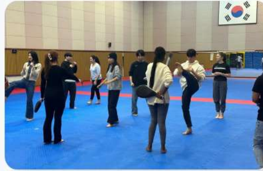
Taekwondo Basic Form