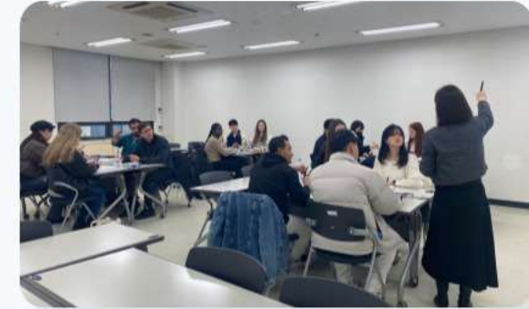
K-Beauty: Make up

Gachon University is thrilled to present an extensive range of activities for your enjoyment during the GISS Period.