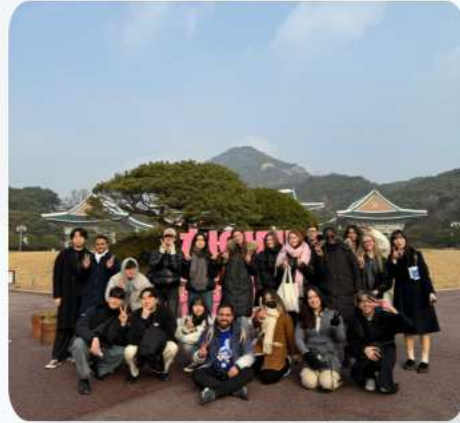
The Blue House