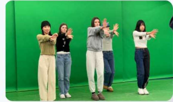
K-Pop Dance class